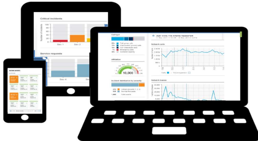
Figure 5-1: Customer Hub offers real-time, role-based access to critical network and services information.

With Customer Hub, CITY OF LAREDO's administrators will be able to monitor system health and maintenance updates. Capabilities include: